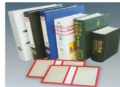
书壳 Hard Cover