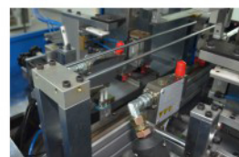
热熔胶喷胶系统 Hot melt Glue Spraying system