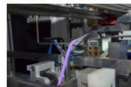
高温切割皮筋 High Temp Elastic Band cutting